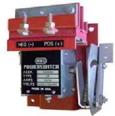
35A LOAD BREAK SWITCH

At our Modern Factory we integrate quality materials with our experience and know how to produce durable switches like these 1000 volt DC fusible and non-fusible disconnects.