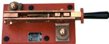
1200 A 1000 VDC SWITCH

NMC-POWERSWITCH can meet your new or replacement DC disconnects switch needs. Call Toll-free 1-800-526-6740 or e-mail pssales@normandymachine.com