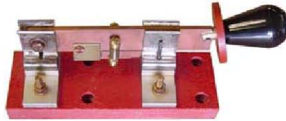
200A NO-LOAD BREAK SWITCH