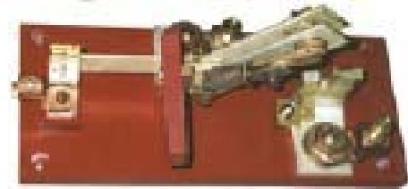
600 AMP 1000 VDC DISCONNECT WITH AUXILIARY BLADE TO GROUND LOAD TERMINAL IN THE OPEN POSITION FOR ENCLOSED EXTERNAL HANDLE OR HOOKSTICK OPERATION