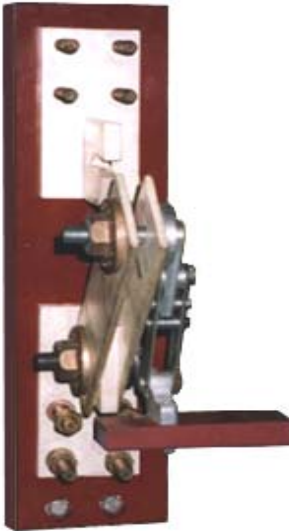
1000 AMP 1000 VDC DISCONNECT FOR ENCLOSED EXTERNAL HANDLE OR HOOKSTICK OPERATION