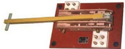
4000 AMP 1000 VDC TRACTION POWER DISCONNECT WITH WAGON HANDLE FOR ENCLOSED VERTICAL MOUNTING

POWERSWITCH Craftsmen combine many years experience machining and fabrication non-ferrous metals (bus-bar copper, silver, brass, bronze, aluminum and insulating materials, (porcelain, fiberglass, plastic) together with the most modern machinery to make the quality assemblies pictured here and on the following pages