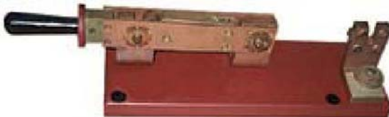
1200 AMP, 750 VDC, SPDT BAT HANDLE OPERATED TRACTION POWER DISCONNECT