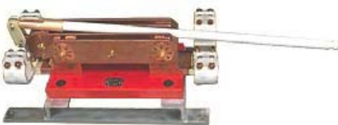
4500 AMP 1000 VDC TRACTION POWER DISCONNECT WITH PULL STICK HANDLE FOR HORIZONTAL TRACKSIDE MOUNTING