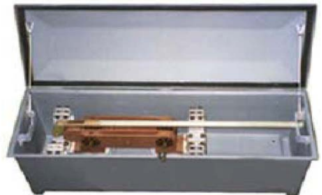
4500 AMP 750 VOLT PULLSTICK OPERATED TRACTION POWER DISCONNECT FOR HORIZONTAL TRACK SIDE MOUNTING

POWERSWITCH Fiberglass Enclosed 600-1000 volt DC Traction Power Disconnect Switches are made in accordance with specific contract specifications. Shown here are some examples of assemblies supplied for new and revamped facilities at MBTA, ST. LOUIS METROLINK, LIRR, SALT LAKE CITY, AND MINNESOTA HIAWATHA LRT