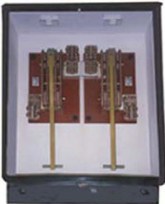
TWO 4000 AMP 1000 VDC PULL STICK OPERATED TRACTION POWER DISCONNECT WITH COMMON FEED