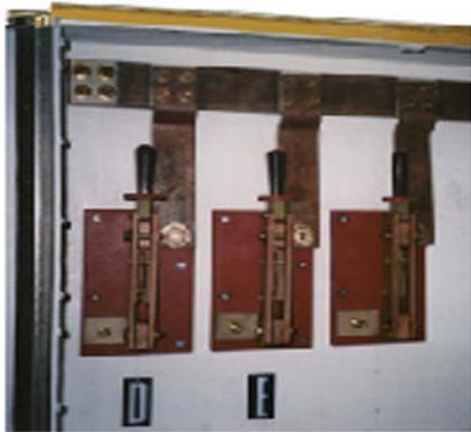
1200 AMP 750 VDC TRACTION POWER DISCONNECTS WITH SUPPLY BUS FOR CONNECTION TO ADJACENT SWITCH BOX