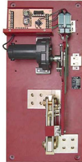
2000 AMP 1000 VDC MOTOR OPERATED TRACTION POWER DISCONNECT FOR MOUNTING IN POWERSWITCH ENCLOSURE OR CUSTOMERS SWITCHGEAR