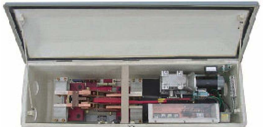
4500 AMP 750 VOLT DC MOTOR OPERATED TRACTION POWER DISCONNECT FOR HORIZONTAL TRACK SIDE MOUNTING

POWERSWITCH Motor Operated Traction Power Disconnect Switches are made in accordance with specific contract specifications. Shown here are some examples of assemblies similar to as supplied for new facilities at DALLAS AREA RAPID TRANSIT, JFK AIRPORT, ST. LOUIS METROLINK, LIRR, PATCO and METRO-NORTH COMMUTER RAILROAD