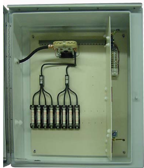
#050108 8 Circuit, 1000 VDC Switch Heater Control Unit for St. Louis Metro Also available #050112 12 Load Fuses; and #050104 4 Load Fuses

POWERSWITCH Switch and Rail Heater Control Units are made in accordance with specific contract specifications. Shown here are some examples of assemblies similar to as supplied at Chicago Transit Authority, and St. Louis Metro.