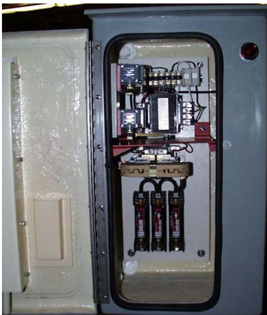
#050526 600 VDC Switch Heater Control Unit With 3 Load Fuses Used by CTA