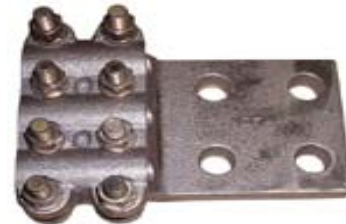
CLAMP TYPE CONNECTOR FOR (3) 500 MCM CABLES WITH 1.75 INCH NEMA 4 HOLE SPACING

Shown here are some of the cable connectors made to be interchangeable with special shapes that are available from POWERSWITCH in small or large quantities