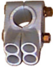
CABLE ADAPTER TO CONNECT (4) 500 MCM CABLES TO ONE 2000 MCM TRACTION POWER CABLE FOR LIRR