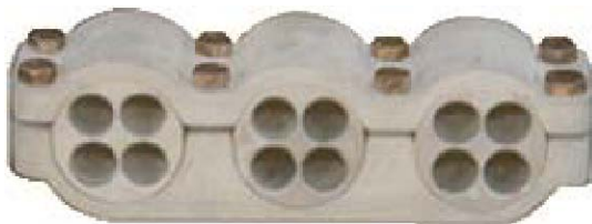
TERMINAL LUG FOR (12) 500 MCM CABLES FOR 6000 AMP LIRR TRACTION POWER DISCONNECT SWITCH