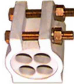
TERMINAL LUG FOR (4) 500 MCM CABLES FOR 4500 AMP LIRR TRACTION POWER DISCONNECT